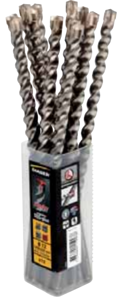
Quadropack Boîte de 6, 12 ou 25 forets identiques